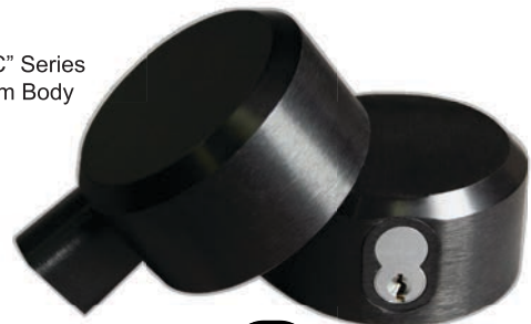
"2170A-IC" Series Aluminum Body

FOR MORE INFORMATION ON OUR PRODUCTS VISIT US ON THE WEB AT WWW.PACLOCK.COM OR GIVE US A CALL AT 888.562.5565 25605 HERCULES STREET, VALENCIA, CA 91355