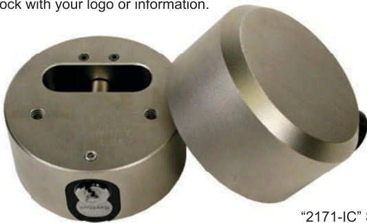
"2171-IC" Series Hardened Steel Body

If you have any questions or concerns about our products give us a call at