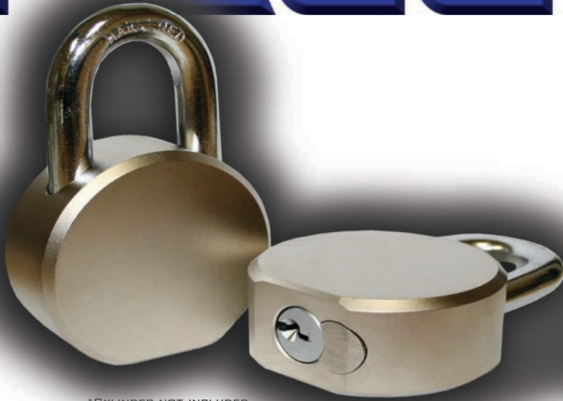
*CYLINDER NOT INCLUDED