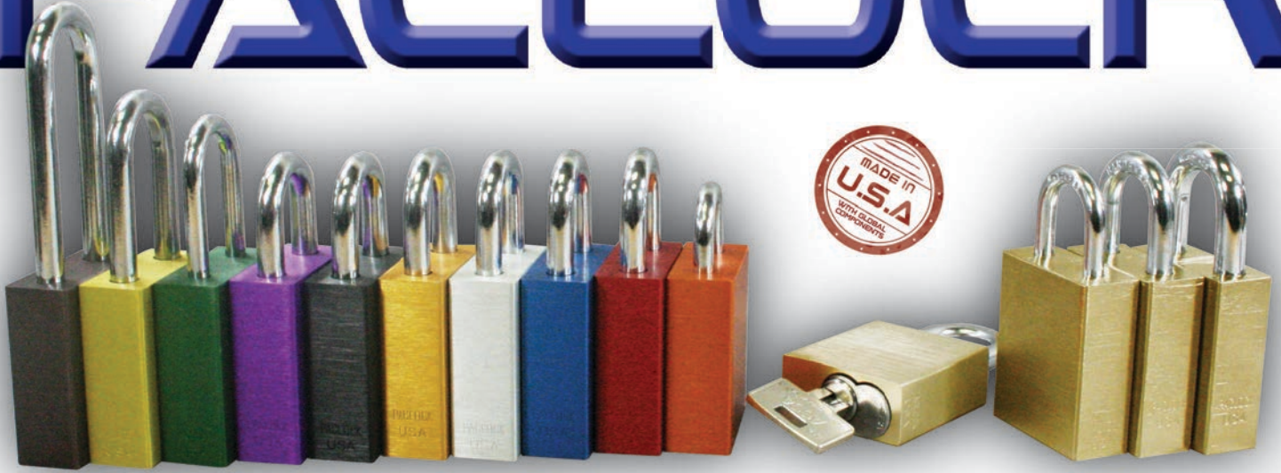
CYLINDER NOT INCLUDED, SHOWN WITH CLEAR BRASS FINISH (NICKEL-PLATED AVAILABLE)