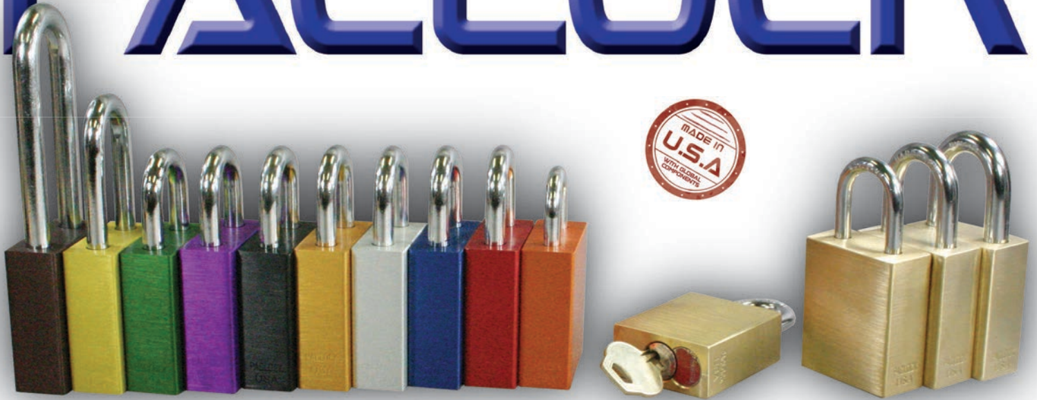
CYLINDER NOT INCLUDED, SHOWN WITH CLEAR BRASS FINISH (NICKEL-PLATED AVAILABLE)