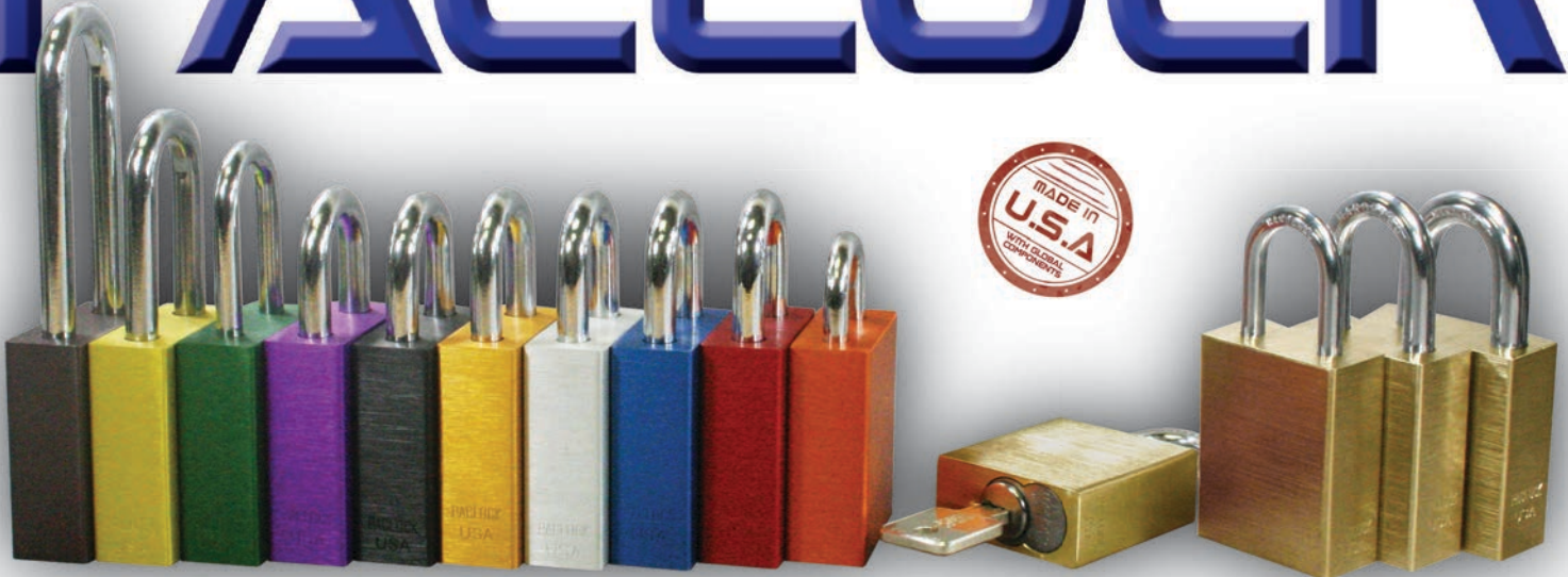
CYLINDER NOT INCLUDED, SHOWN WITH CLEAR BRASS FINISH (NICKEL-PLATED AVAILABLE)