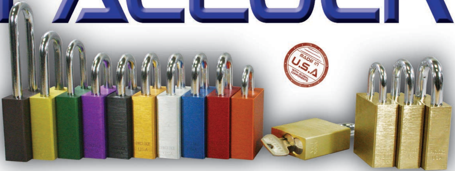
CYLINDER NOT INCLUDED, SHOWN WITH CLEAR BRASS FINISH (NICKEL-PLATED AVAILABLE)